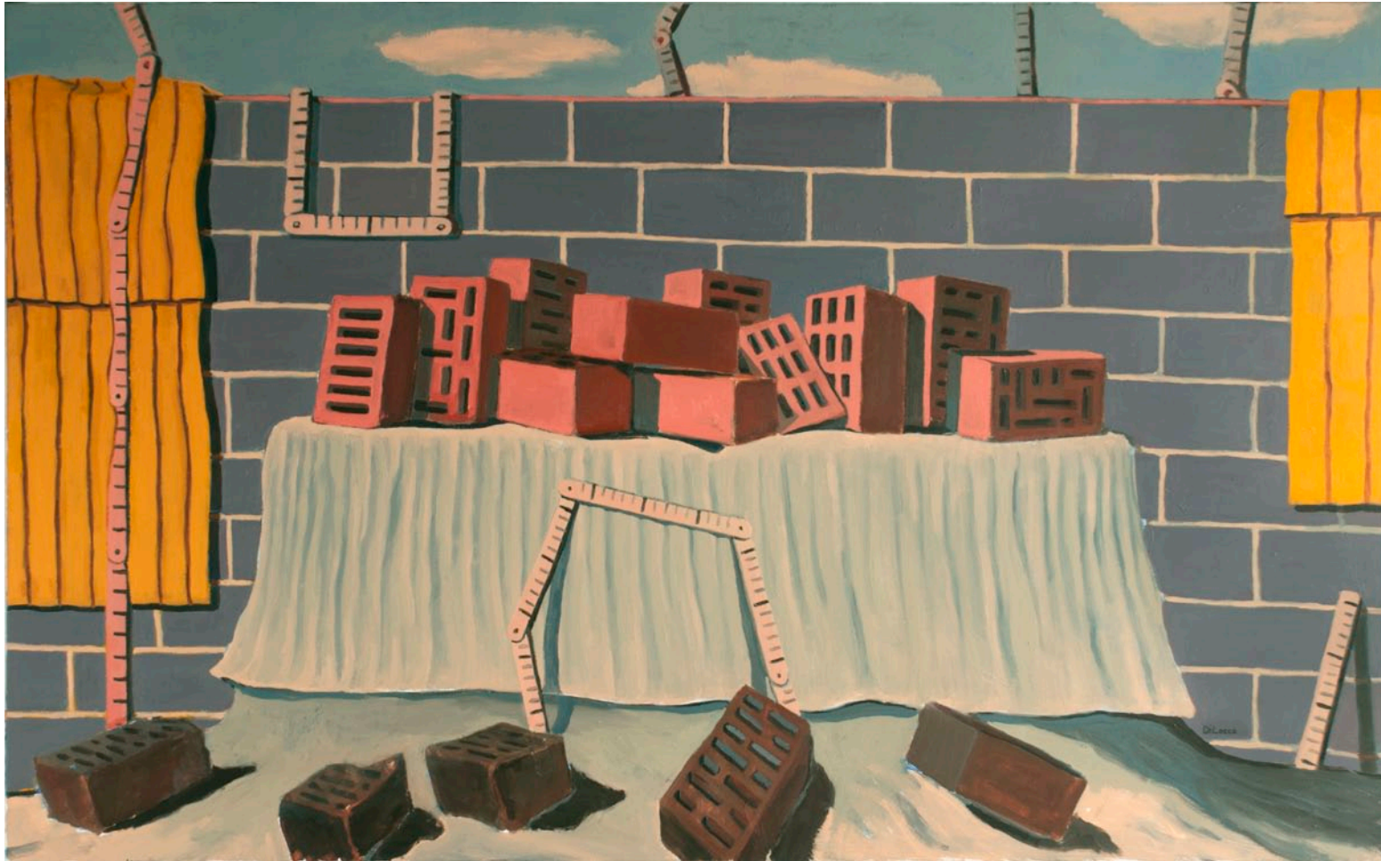
Mahlzeit, 2017, oil on canvas, 135 x 85 cm