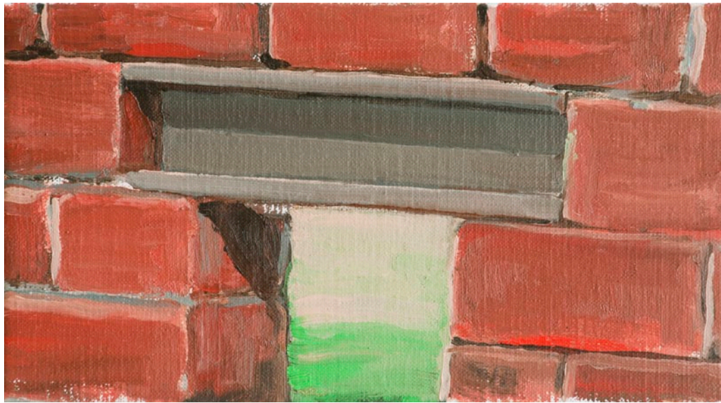
Der Sturz, 2018, oil on canvas, 32 x 18 cm